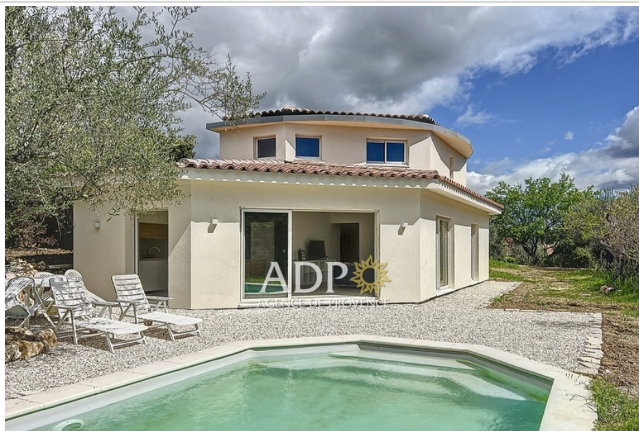
House 711 Plascassier

Recent BIOCLIMATIC house to be completed (insulation/plastering on a section of wall, creation of a dry stone wall which is on site, garden design). 5-room house composed on the ground floor of a living room with open-plan kitchen, pantry, a bedroom and a shower room. Upstairs two bedrooms and an office, a bathroom. Garden of 1120 m2 with salt swimming pool. Contact Steffi 06 19 63 96 09 Information on the risks to which this property is exposed is available on the georisks website: www.georiques.gouv.fr