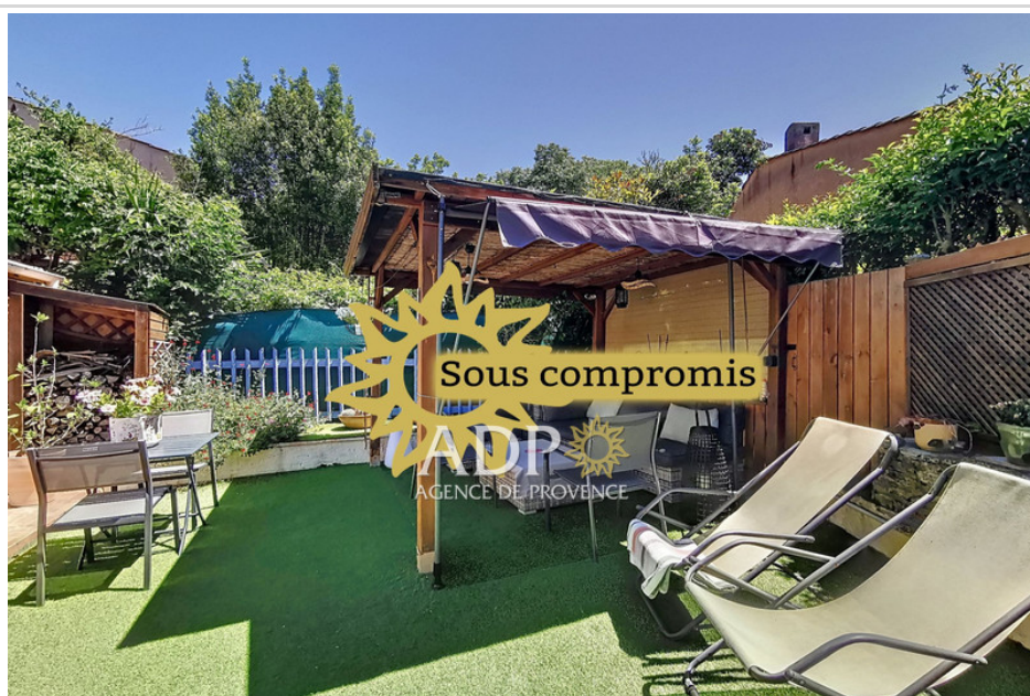
House 2773 Mouans-Sartoux

4,44% VAT of fees paid by the buyer (450 000 € without fees), well condominium (145 lots in the condominium), annual current expenses 240 € (20 € monthly), no current procedure, information on the risks to which this property is exposed is available on georisques.gouv.fr .