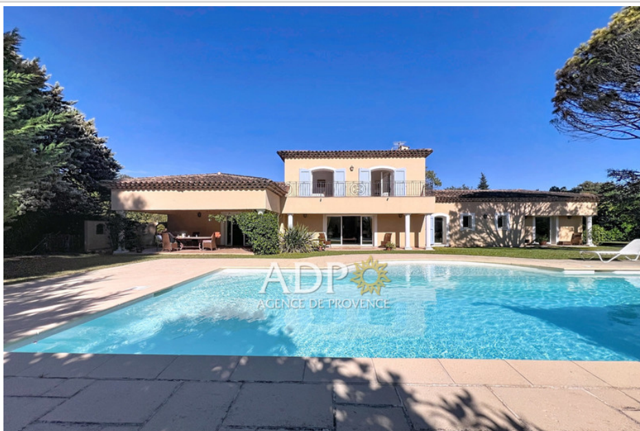
House 759 Grasse

Fees paid by the owner, no current procedure, information on the risks to which this property is exposed is available on georisques.gouv.fr .