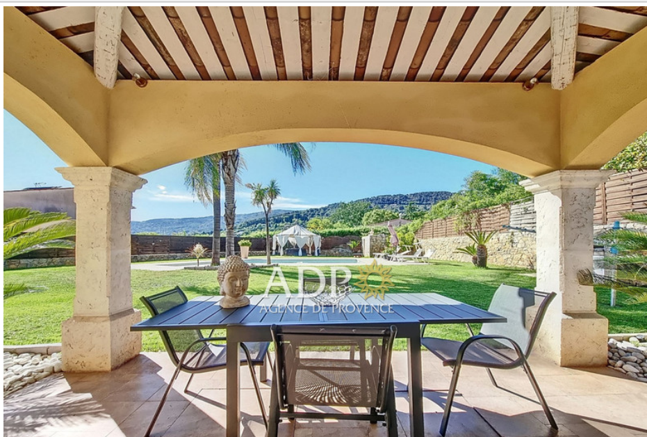
Villa 2512 Grasse

Fees paid by the owner, no current procedure, information on the risks to which this property is exposed is available on georisques.gouv.fr .