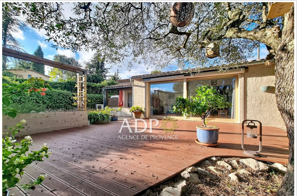
House 2536 Peymeinade

Fees paid by the owner, no current procedure, information on the risks to which this property is exposed is available on georisques.gouv.fr .